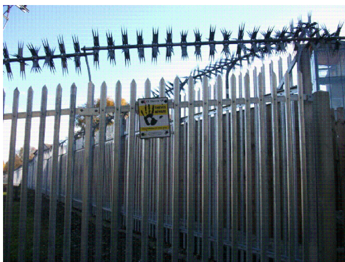
ANTI VANDAL CLIMB BARRIERS

The signs will be Hi Visibility 150 x 200mm and manufactured from UV stabilised plastic material they will be mechanically fixed with anti – clutch screws direct to the wall or by using metal brackets for fencing these should be on each elevation at high level with a minimum spacing of 10m on walls and on non Statuary Regulation fencing.