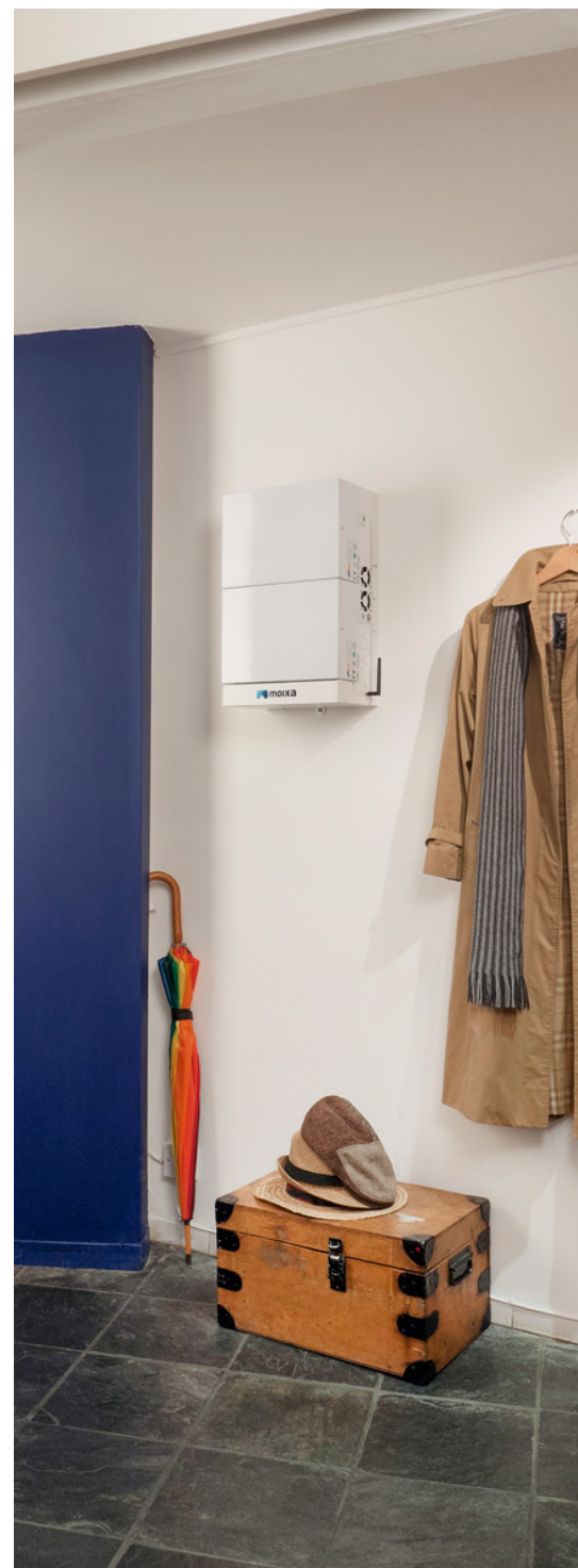
Smart battery installed in a domestic property in Barnsley.